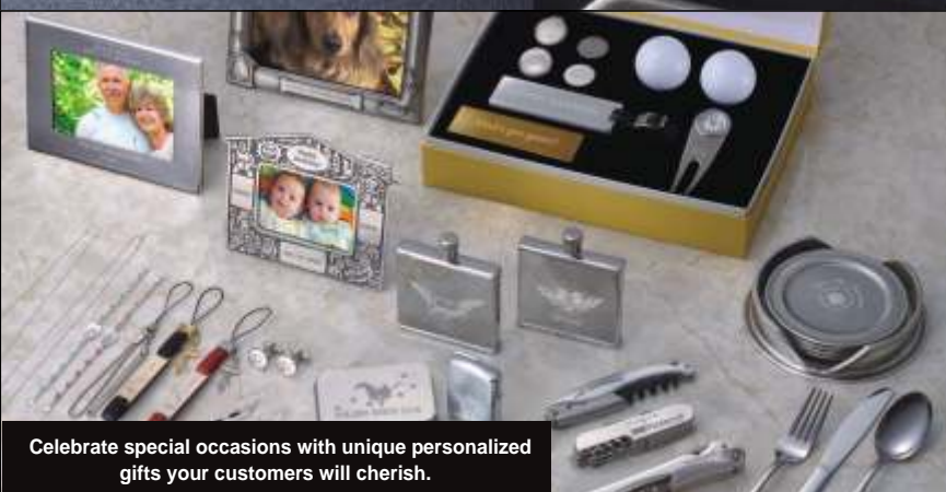
Celebrate special occasions with unique personalized gifts your customers will cherish.