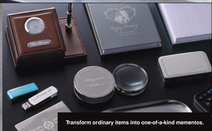
Transform ordinary items into one-of-a-kind mementos.